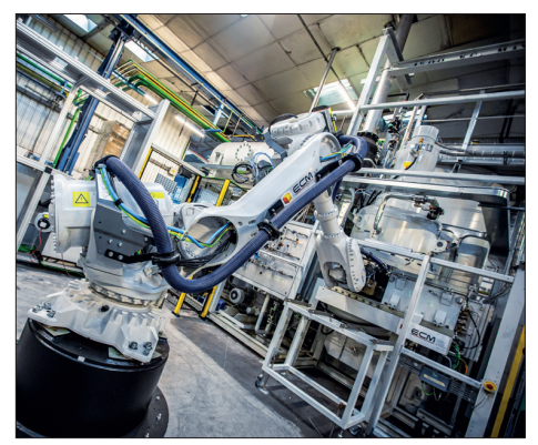
NANO loading by ECM ROBOTICS

The NANO system has been designed to maximize its compliance with robotics, making it an easily integrated solution. The automation allows complete autonomy in the transfer of parts from one station to another and reinforces the efficiency of production in a compact space. The furnace, process and robotics eco-system enables manufacturers to achieve their objectives of profitability, flow optimization and quality.